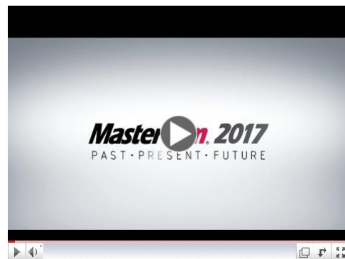
Mastercam 2017 Interface

Mastercam is looking to release a new public beta approximately once a month. Known issues, updated bug fixes, and other details will be delivered when you install the current Mastercam 2017 Beta and through the Mastercam forum.