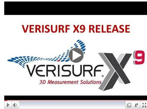
Verisurf X9 Release