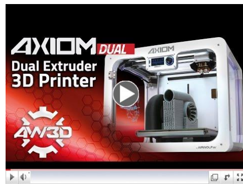
Airwolf 3D AXIOM Printer